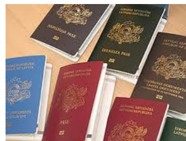
Examples of passports.