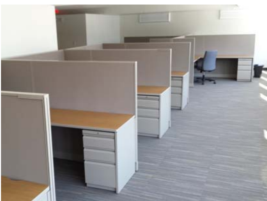
New User space in the counting house 2 nd floor.

which is the primary sponsor of Jefferson Lab, will require that a limited set of information relating to your user project/experiment be transmitted to SC at the conclusion of the current fiscal year. A subset of this information, including your