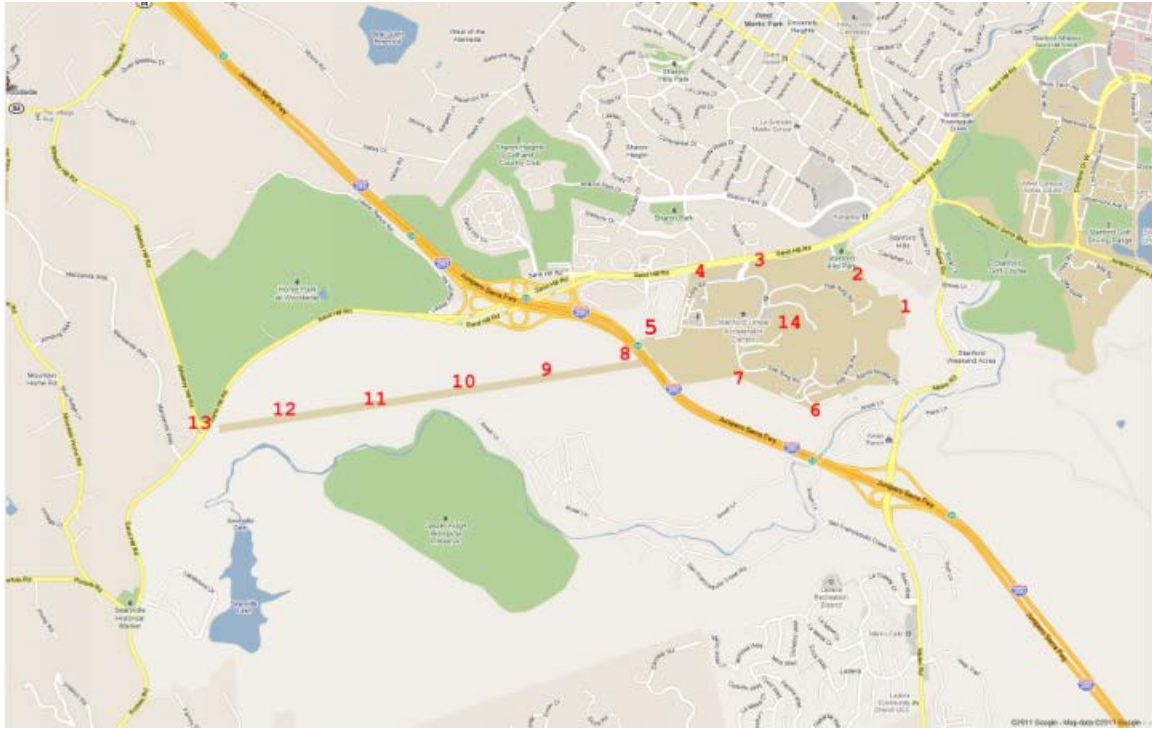
Figure 2 SLAC Map